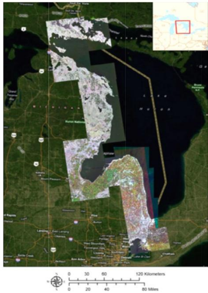
Radar mosaic of Lake Huron Coastal Zone

“Due, in part, to their limited capacity for adaptation, wetlands are considered to be among the ecosystems most vulnerable to climate change.” Climate Change and Water: IPCC June 2008