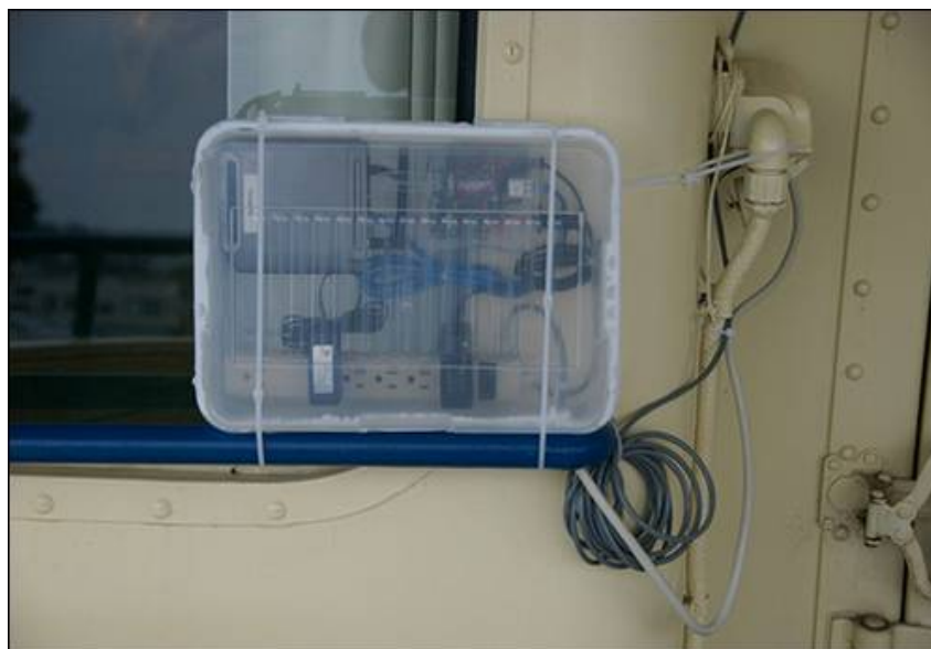
Figure 5. GPS Sensor