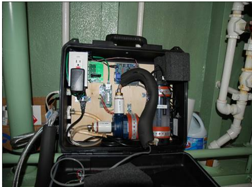
Figure 4. Water Sensor