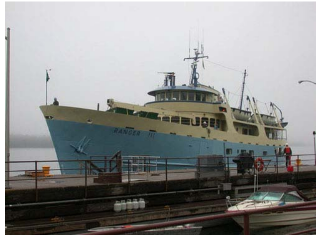
Figure 3. Ranger III in port

The Ranger III carries park visitors to and from Isle Royale National Park twice weekly between May and September, providing an ideal platform for regular time-series data collection. The information collected would greatly benefit climate, ecological, and biogeochemical research on Lake Superior. A major problem in studying large ecosystems such as Lake Superior is the need for spatial coverage to complement time-series data from weather buoys. Presently, time series data for only a few parameters are collected in offshore waters. Synoptic spatial surveys of the lake are limited to a few variables measured by satellite or infrequent ship based surveys. The Ranger III would cross a central basin, providing both time series measurements as well as spatial coastal and deep-water coverage.